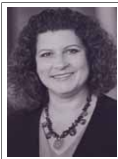
By Pam Enz, ASID Tangible Space Interior Design

Color is one of the most exciting, dramatic, and feared design elements we deal with when embarking on final decisions with our clients. Although everyone wants to add color in their lives, when it comes to applying it in large quantities to their walls they often back off and resist.