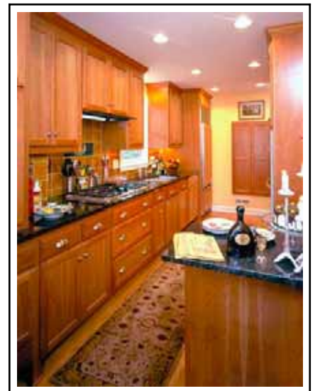
Our 2003 CotY Award Winning Kitchen

In addition, a large pantry cabinet inset into the kitchen wall provides ample room for canned goods and jars (where there would otherwise be no space available.) Floor to ceiling cabinets opposite the sink and cook top contain the major cooking ap-