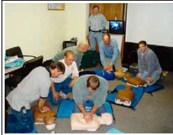
Heritage employees practice their CPR skills at our Annual First Aid and CPR training seminar

office parking lot. A few Heritage employees wore makeup to simulate cuts and bruises while the rest of us responded to the scene to provide first aid and take charge of the situation. It was quite an exciting way to practice the important skills that could someday help save a life!