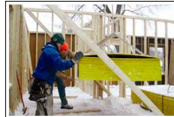
The Heritage crew hard at work on another great remodeling project.