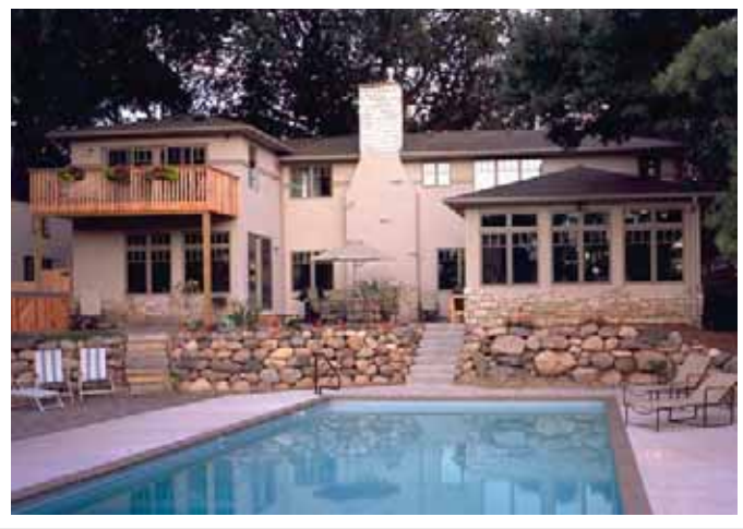
A beautiful composition such as this can only be achieved with good communication with our clients.

taking the time to get to know you and allows us to understand your priorities, vision,