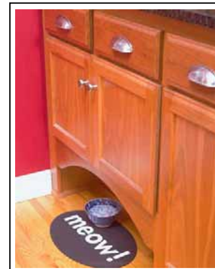
A unique space-saving solution for feeding the cats.

Granite countertops, custom cherry cabinets, and beautiful ceramic tiles make this kitchen a beauty, but it's the creative and functional storage spaces that make this kitchen such a winner.