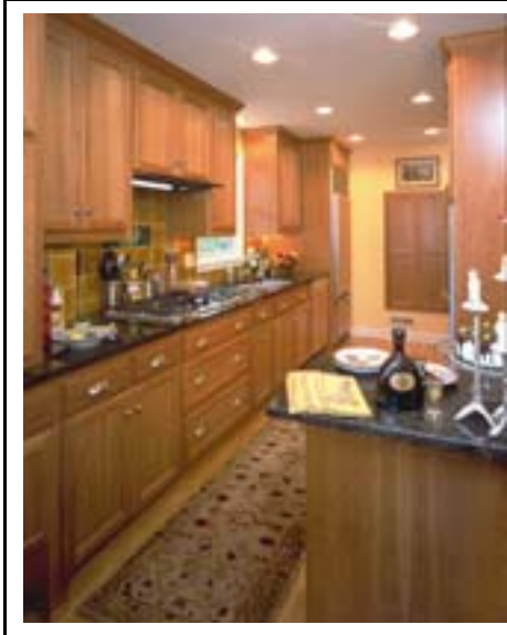
Winner of the 2003 CotY Award for Best Kitchen 2004 ROMA Honorable Mention for Best Kitchen

Heritage Builders Inc. is a fully licensed Design/Build Remodeling firm located in Saint Louis Park, MN. We specialize in all types of home design and remodeling, from the smaller projects to entire house remodels. Our 33-year tradition of in-house design services combined with our on-staff craftsmen can help you create the home of your dreams.