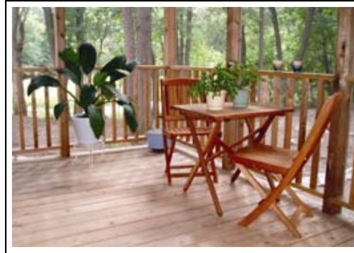
Rindal Screen Porch - Winner of the 2004 ROMA Award for Whole House Remodel

We used to show clients a sample chain of ten stock laminate colors for counter-