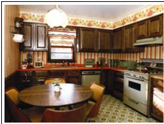
Another Fine Heritage Kitchen Remodel - Circa 1972

electric range, and exhaust hood – not to mention all of the small kitchen appliances! The trendy orange