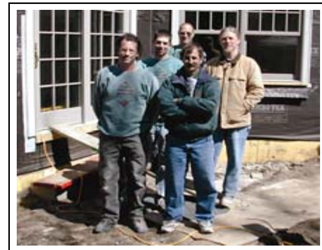
The Heritage Builders' Field Crew