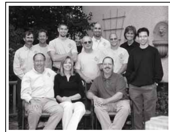
The Heritage Builders Team

getting out of the city and heading up to Northern Minnesota for some deer hunting this fall.